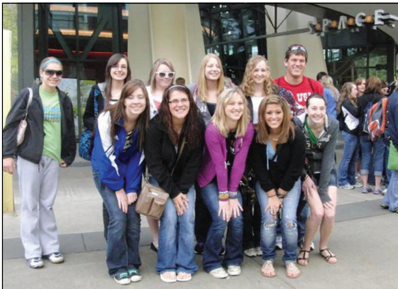
Members of the Lakeview Senior High Band at the base of the Space Needle in Seattle, Washington.